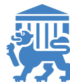
PSKOV STATE UNIVERSITY