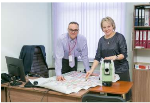
Construction Control Service