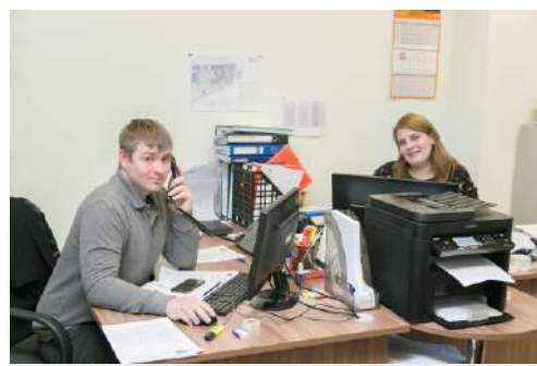
Property and Legal Services