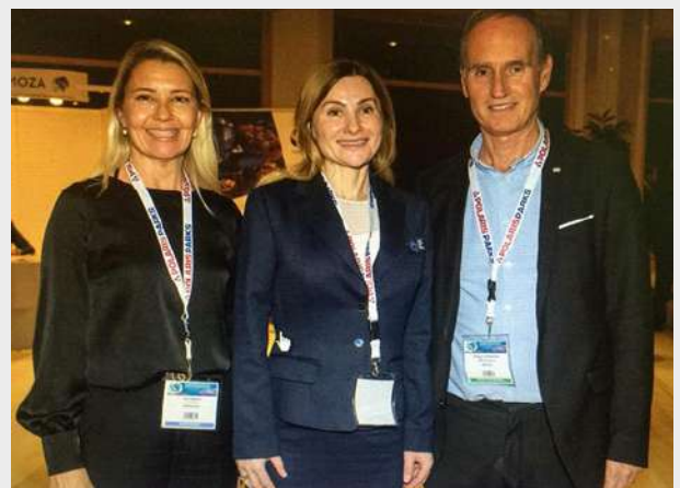
SU-MEET «World Free & Special Economic Zones Summit», Монако, 2019 г.