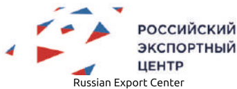
Russian Export Center