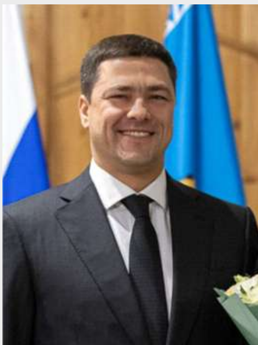
Governor of the Pskov region Mikhail Vedernikov