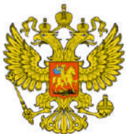
Ministry of Development