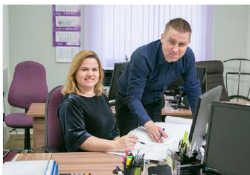
Project management service